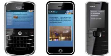
Smart Phones ↗